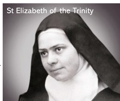
St Elizabeth of the Trinity