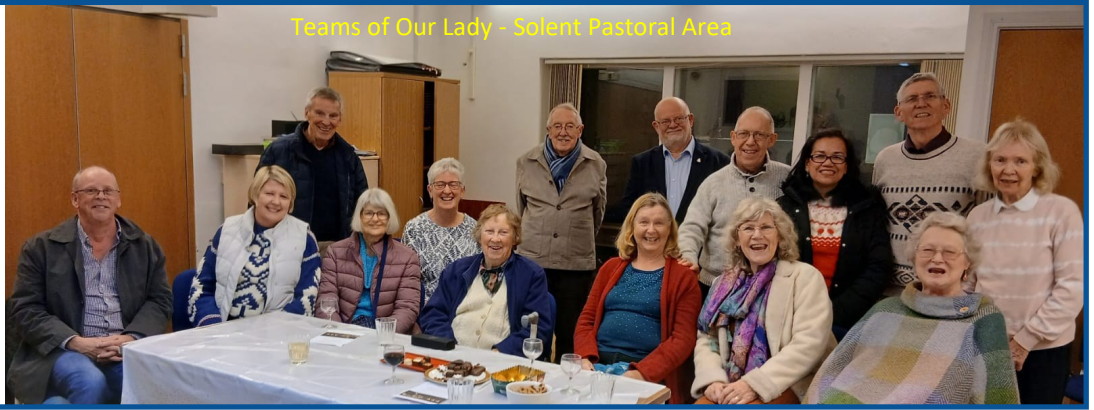
Teams of Our Lady - Solent Pastoral Area